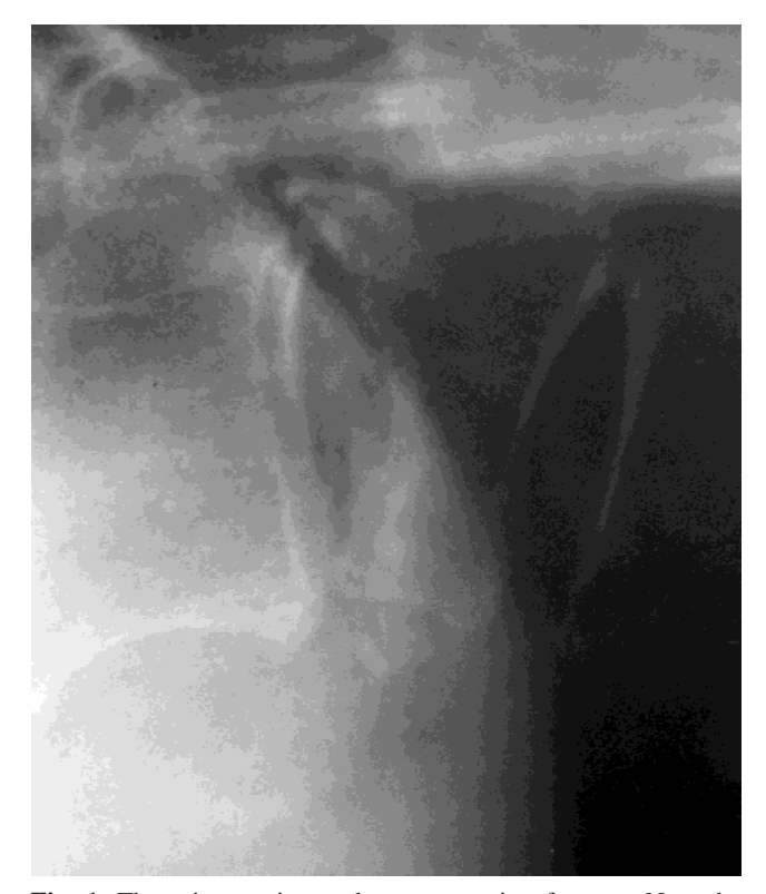
Fig. 1. Thoracic anterior wedge compression fracture. Note the loss of anterior body height.