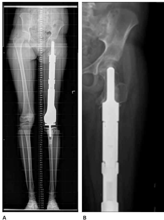
Figure 4: Post-operative follow up in a 9-year-old patient with osteosarcoma of the left femur. (A) AP 32-inch plain radiograph showing 2.8 cm of LLD. (B) AP plain radiograph of the pelvis showing normal development of the acetabula and a congruent hip joint.

to this clinical scenario could be an alternative to a total femoral replacement in the appropriate patient. MRI images play an important role in defining the limits of the femoral involvement and the suitability for an osteotomy to be performed. We never have to sacrifice free margins of resection and do the osteotomy if this could be achieved. We think that preserving the proximal femoral segment will maintain hip stability through a normal acetabula development and congruency between the femoral head and acetabulum as well as preserving an acceptable function of the abductors muscle.