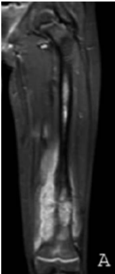
Figure 3: Pre-operative coronal T1 weighted view – fat suppression MRI showing skip intramedullary involvement of the left femoral diaphysis of a nine year old girl with left femoral osteosarcoma undergoing reconstruction with a second generation expandable endoprosthesis.

period of time. At 55 months of follow up, she has a LLD of 2.8 cm (Fig 4A) and underwent a contralateral epiphysiodesis (distal femur, proximal tibia and proximal fibula). She is doing clinically well, with limping due to the LLD, is continuously disease free, with preservation of the native hip and has a well shaped acetabulum (Fig.4B) with no clinical hip instability.