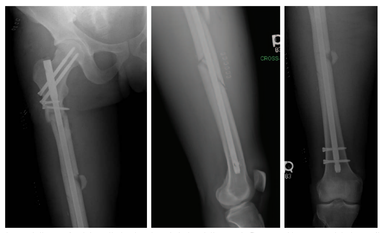
Figure 5. Intra-operative Xrays are performed prior to waking the patient and contaminating the surgical instrumentation. These are essential to ensure extra-articular placement of implants as well as gross alignment. Length and rotation are also evaluated clinically prior to waking the patient.

If the mechanical axis is markedly off due to a malpositioned starting point or loss of reduction of the unstable segment, the nail can be removed, and the starting point may be eccentrically reamed. This can be achieved by temporarily placing a onethird tubular plate into the proximal hole on the opposite side of which you choose to eccentrically ream. The plate will force the reamer in the opposite direction, allowing for the hole to be opened eccentrically. The nail can then be passed again, and alignment must be reevaluated. Another option for adjusting alignment once the canal has been reamed is to utilize cortical replacing screws (also known as Poller screws or blocking screws) in order to translate the bone relative to the nail.