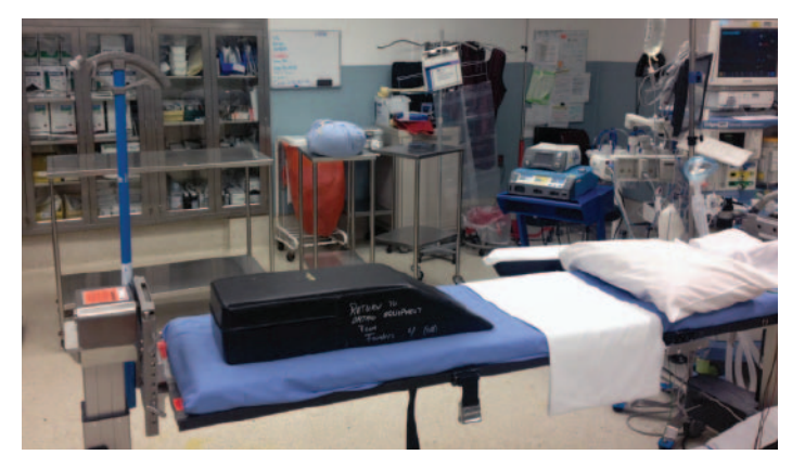
Figure 2. Typical operating room setup depicting a radiolucent flat top table with a black foam ramp for proper positioning. The proximal apex of the triangle is placed at the gluteal fold. A pipe bender is attached to the end of the table on the contralateral side to the injury. Skeletal traction is applied longitudinally over the pipe bender with 10-15 lbs of weights attached to sterile rope.

rotation before the patient is prepped and draped. The first consideration should be restoration of length. When significant cortical comminution exists, length can be gauged from the contralateral leg. However, because of patient positioning on a bump as well as the sterile drapes,