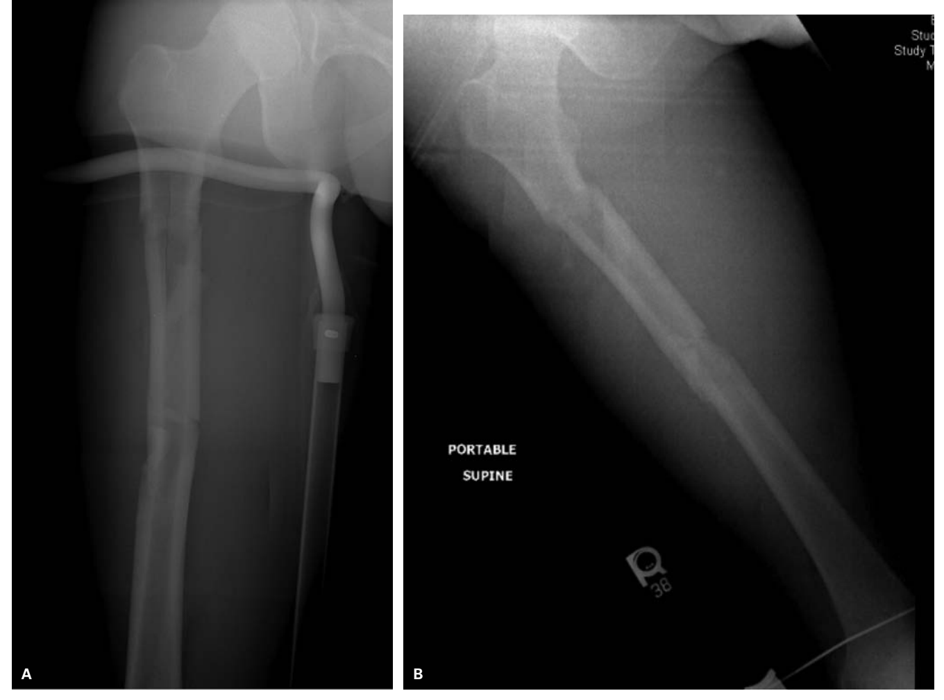
Figure 1. Injury films taken in the trauma bay. The patient was initially placed in a Hare Traction splint (A), followed by skeletal traction (B).