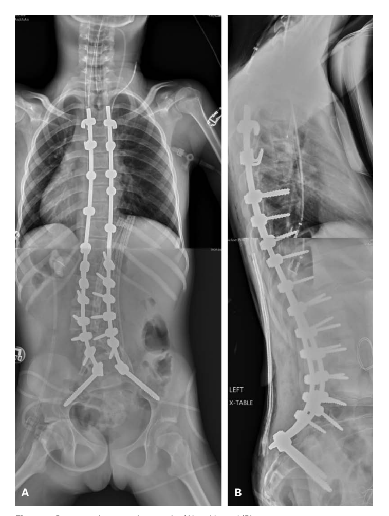
Figure 4. Postoperative posterior-anterior (A) and lateral (B).

Intraoperative rib-to-pelvis temporary distraction can be safely performed to correct pelvic obliquity in the neuromuscular spine in a single setting and should be considered in the challenging neuromuscular patient.