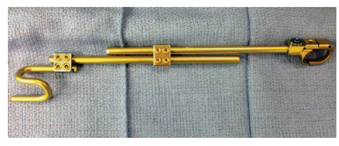
Figure 2 . Construct used for the temporary intraoperative rib-to-pelvis traction.

While previous use of the unit rod allowed for increased correction of pelvic obliquity due to the nature of its construct, there are several drawbacks. It is a technically demanding procedure, it has a fixed angle to the pelvis, and it necessitates the use of segmental sublaminar wires that require entering the canal at multiple levels. Mechanical failure can also occur either intraoperatively, due to cut out from poor bone quality, or postoperatively, due to loosening. Transition to segmental rod use has evolved from hooks and wires to hybrid constructs that use hooks, wires, and pedicle screws, and finally to predominantly all-screw constructs. The benefits of pedicle screws have been well described, including 3-column fixation and improved axial correction.<sup>18-20</sup> In cases when pelvic fixation is required, options include iliac screws, sacral (S1) screw fixation, or both. Recently, popularization of SAI screw fixation has led to novel pelvic fixation.