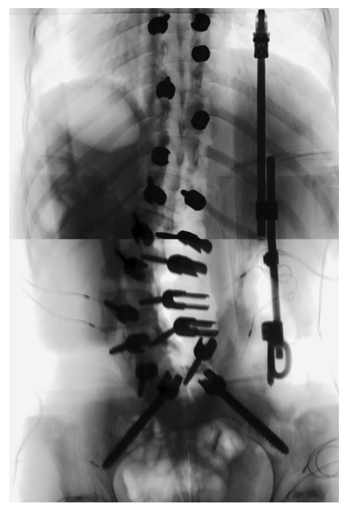
Figure 3. Intraoperative posterior-anterior (PA) radiograph with rib-to-pelvis distraction in place with level pelvis

In our case, we were able to rely on the VEPTR® to correct our pelvic obliquity safely in a single setting without having to rely on the screws when the potential for bonescrew interface failure is significant in patients with poor bone quality. Also, having our temporary distraction away from the midline afforded us multiple benefits: 1) the moment arm of correction was more powerful than having to correct the pelvic obliquity near the midline, 2) we were able to instrument the entire spine while the distraction rod continued to work as it was not obstructing our operative field, 3) the temporary distraction was entirely within the operative field and controlled by the surgeon, 4) none of our final implants utilized an area occupied by the temporary ribto-pelvis rod so as not to compromise any fixation points, and 5) the temporary distraction could also take advantage of the viscoelastic properties of the spine and be left in, if needed, for a staged procedure.