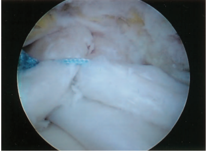
Figure 3. Margin convergence shifts tissue toward the cuff margin.

placing side-to-side sutures in the tear which shifts the adjacent tissue into the cuff defect. This technique shortens the medial-lateral dimension as the free margin "converges" toward the tuberosity. This results in decreased strain in the rotator cuff margin (Figure 3).