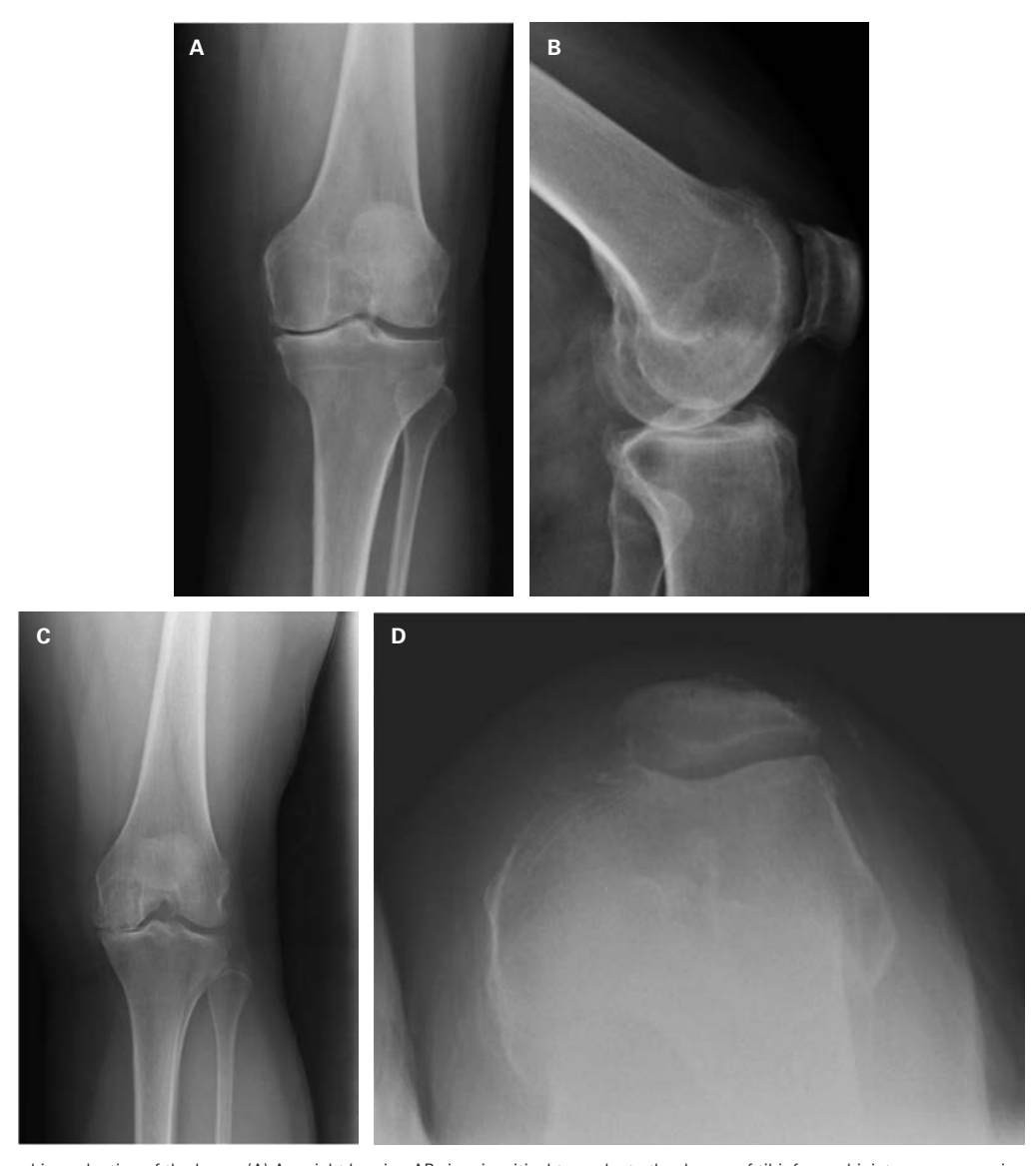
Figure 1. Standard radiographic evaluation of the knee. (A) A weight bearing AP view is critical to evaluate the degree of tibiofemoral joint space narrowing. (B) The lateral view, taken at 30° of flexion, allows for radiographic assessment of the patellofemoral compartment and is also particularly helpful for assessing posterior tibiofemoral wear patterns that are not readily apparent on AP views. (C) A weight bearing 45° PA (Rosenberg) flexion view is an alternative view to assess posterior wear patterns. (D) The Merchant view allows for radiographic assessment of the patellofemoral compartment.

the tension of the native soft-tissues/ligaments to determine the appropriate level of bone resection. Most surgeons use a combination of both techniques to achieve TKA balance. The authors prefer the use of gap balancing for the extension gap and then matching the flexion gap with the use of a measured resection technique.