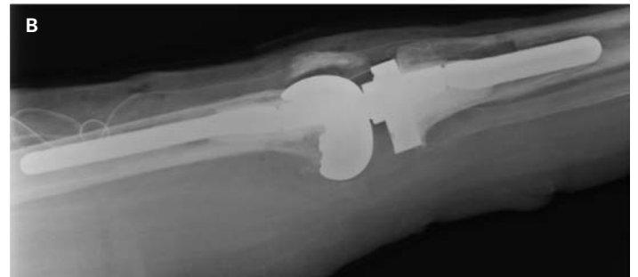
Figure 2. AP (A) and lateral (B) postoperative radiographs of a patient undergoing revision TKA with press fit femoral and tibial stems and cemented metaphyseal components.