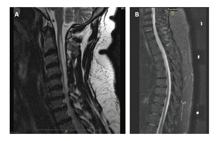
Figure 3. Sagittal cervical (A) and Sagittal Thoracic (B) T2-weighted magnetic resonance imaging of the spine.

inflammatory arthritis, <sup>9</sup> cancer, <sup>10</sup> or carpal tunnel syndrome, <sup>11</sup> resulting in a misdiagnosis. Several of the reported cases have unique presentations, <sup>12-14</sup> but typical symptoms include pain, swelling, and loss in range of motion. Radiographic studies usually show osteolysis, fluid collection, and degeneration resembling septic arthritis. There is no established consensus on the treatment of neuropathic arthropathy secondary to syringomyelia. Treatment strategies have ranged from neurosurgical treatment of the syringomyelia and orthopaedic