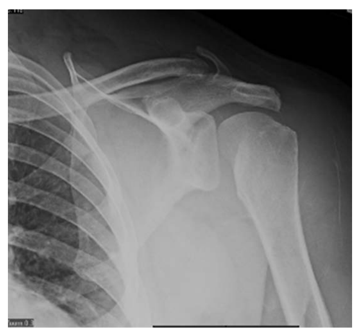
Figure 1. AP Radiograph of the Left Shoulder.

inflammatory arthritis, <sup>9</sup> cancer, <sup>10</sup> or carpal tunnel syndrome, <sup>11</sup> resulting in a misdiagnosis. Several of the reported cases have unique presentations, <sup>12-14</sup> but typical symptoms include pain, swelling, and loss in range of motion. Radiographic studies usually show osteolysis, fluid collection, and degeneration resembling septic arthritis. There is no established consensus on the treatment of neuropathic arthropathy secondary to syringomyelia. Treatment strategies have ranged from neurosurgical treatment of the syringomyelia and orthopaedic