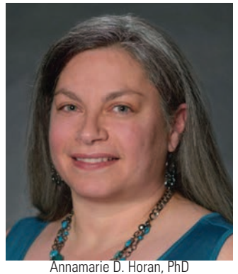
Director, Clinical Research, University of Pennsylvania Department of Orthopaedic Surgery

themes for Penn Orthopaedics Human Subjects Research (HSR) in FY15 are and collaboration. Starting in July 2014, the clinical research program of Penn Orthopaedics joined forces with the Department of Anesthesiology Critical Care (ACC) to take advantage of the overlap in our patient populations and complementary research goals. Since the last edition of the UPOJ, our team of Orthopaedic Clinical Research