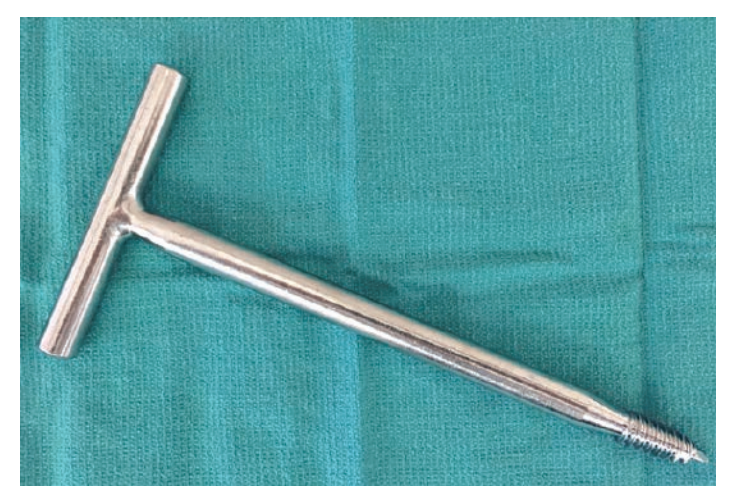
Figure 1. Corkscrew used for femoral head extraction.

Acetabular exposure may be achieved using a variety of retractors. To aid in the ease of exposure, placing the leg in slight abduction, extension, and internal rotation allows for better visualization. A Shnitt is placed over the anterior lip of the acetabulum to create a small rent in the anterior capsule at the level of the anterosuperior column. A #2 hip retractor is then inserted into the defect and seated on the anterior column. Next, a #7 retractor is placed distal to the transverse acetabular ligament and over the posterior acetabular wall (Figures 2 and 3). The two retractors should be orthogonal to each other. Using a combination of the suction tip and the electrocautery, the pulvinar tissue is removed from the cotyloid fossa. The extracted femoral head is measured using the sizing templates to estimate the component size. Hemiarthroplasty