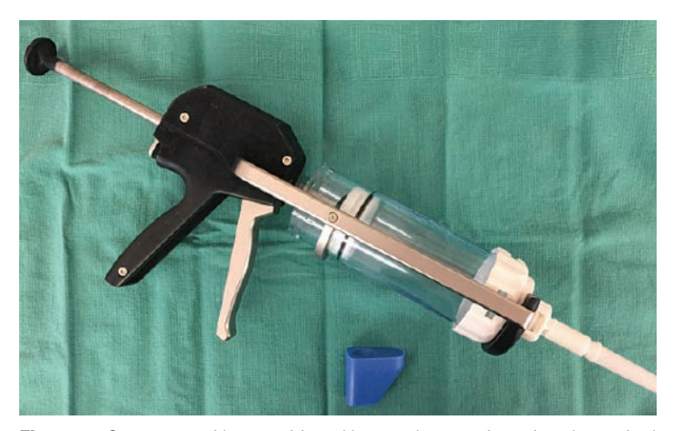
Figure 4. Cement gun with pressurizing rubber attachment to insert into the proximal femoral canal.

into the canal to the level of the cement restrictor. Cement is then introduced into the canal, allowing the building pressure in the canal to push the cement gun out of the femoral canal; do not prematurely retract the cement gun. Once the cement adequately fills the canal, a pressurizing device is placed over the proximal femoral canal and additional cement is introduced under pressure (Figure 4). It is critical to re-notify the Anesthesia team of cement pressurization, as this is the time period of highest risk for fat embolism. Finally, implant the prosthesis in the correct version until it is adequately seated. The goal is to create a 2 mm circumferential, uniform cement mantle. Once the version is set and the implant is properly seated, maintain firm pressure on the stem until the cement hardens but do not change the version (Figure 5). Any subtle rotation of the stem during implantation will result in cement mantle imperfections and increase the chances of early component loosening.