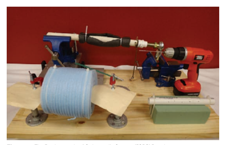
Figure 1. The Fundamentals of Orthopaedic Surgery (FORS) Board.

Similarly, Coughlin et al<sup>18</sup> developed and validated a simple box model for training and evaluating learners on specific fundamental psychomotor skills of arthroscopy (Figure 2).