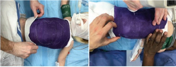
Figure 2. After the cast is applied, the patient is transferred back to the stretcher where windows in the cast are made to allow for improved respiratory mechanics. The posterior window is removed on the concavity of the deformity, in this case, the right side of the chest only.