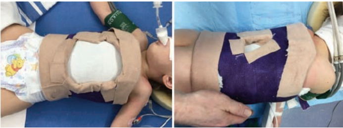
Figure 3. Moleskin is applied to the edges of the cast, covering all fiberglass surfaces.

posterior window on the opposite side of the curve. Cast edges are then padded with moleskin to prevent skin irritation (Figure 3).