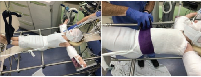
Figure 1. The patient is positioned on the Mehta table with arms abducted and padded. Halter traction is applied to the head, and stockinette overlying the iliac crest provides a traction force with the legs flexed, producing elongation and flexion. The plaster cast is applied and molded to derotate the rib cage.