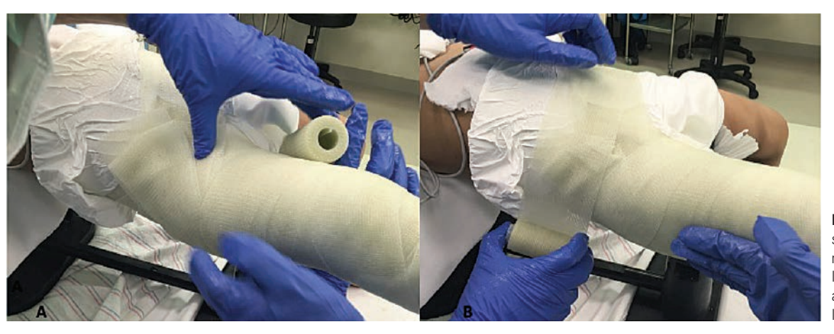
Figure 3. (A) 6-8 layer fiberglass struts are added to enhance the mechanical stability between the leg and pelvis portion of the cast and (B) overwrapped with one layer of casting tape.