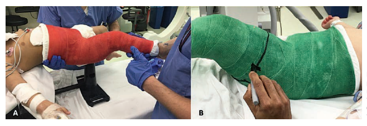
Figure 4. (A) Final casting position. The child can now be removed from the spica table and final fluoroscopy taken (B) The cast can be annotated using fluoroscopy to facilitate future wedging.