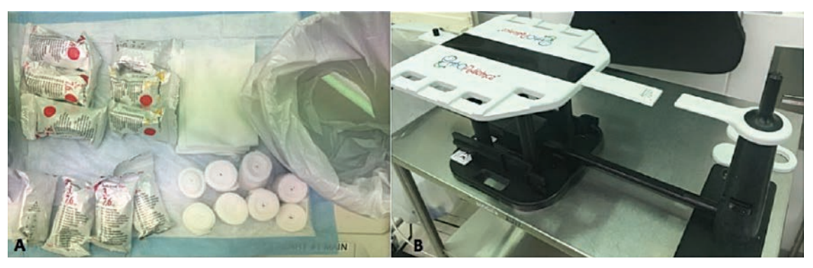
Figure 1. (A) Supplies include 2 and 3 inch fiberglass cast tape, soft roll, and stockinette folded to be placed on the stomach (B) One variation of hip spica table.

The proximal (box) portion of the spica table should end on the mid thoracic spine, at approximately T7, fully supporting the shoulders. The well-padded distal post of the spica table should be adjusted so that it rests snugly against the patient's perineum, supporting the sacrum. The patient's arms may be secured to the side