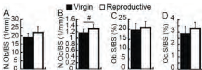
Figure 2. Cell activities 4 weeks post-OVX in virgin and reproductive rats.

a 53% decrease in BV/TV, with no changes in Conn.D, Tb.N, Tb.Th, or whole-bone stiffness. Prior to surgery, reproductive rats had 49%, 77%, and 50% lower BV/TV, Conn.D, and Tb.N, respectively, than virgins ( p < 0.05 ), but by 12 weeks post-OVX, these parameters were not different between the two groups. Reproductive rats had 13-17% greater Tb.Th, as well as 22%, 10-13%, and 7-12% greater polar moment of inertia (pMOI), cortical area (Ct.Area), and cortical thickness (Ct.Th) than virgins throughout the study ( p < 0.05 ). Because of the differential post-OVX reductions in whole-bone stiffness between the two groups, virgin rats had 13% lower whole-bone stiffness than the reproductive group by 12 weeks post-OVX. Histomorphometry indicated that virgin and reproductive rats had highly similar osteoblast and osteoclast numbers and surfaces at 4 weeks post-OVX (Fig 2). Multiple linear regression showed that the combination of baseline Tb.N and Tb.Th was most strongly associated with the percent decrease in BV/TV, with an adjusted r^2 = 0.69 . ITD analysis (Fig 3) showed that virgin rats underwent a 125-179% greater rate of rod disconnection and plate perforation than the reproductive group. Furthermore, the trabeculae that underwent connectivity deterioration were significantly less thick than those that remained intact after OVX ( p < 0.05 ). Analysis of the overall distribution of trabecular thicknesses