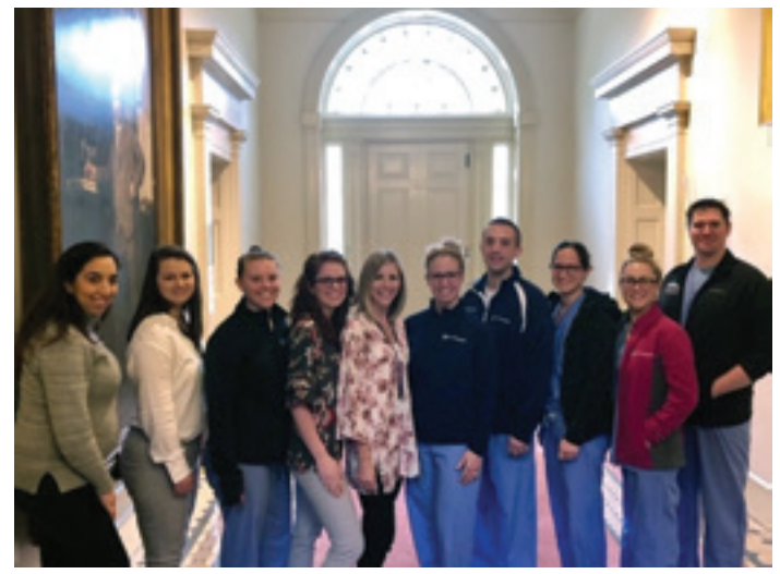
Figure 1. Some of the many APPs after a meeting at Pennsylvania Hospital

In summary, the advanced practitioners of Orthopaedic surgery are highly valued members of the clinical care team. I would like to take this opportunity to personally congratulate the advanced practitioners on their achievements and thank them for their endless dedication and commitment to the department and patients.